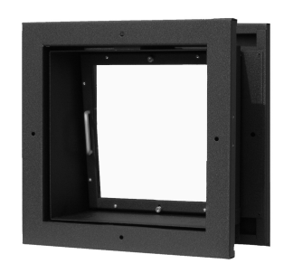
(no Projector Shelf)