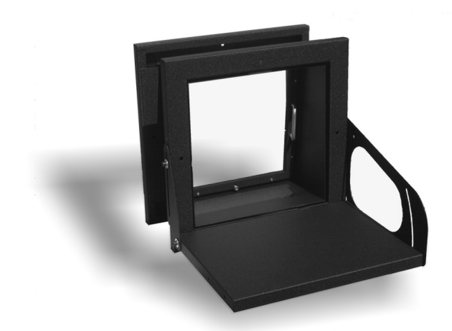
Small Projection port (includes Projector Shelf)