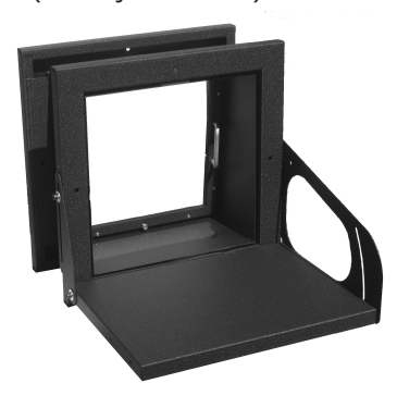
Small Projection port (includes Projector Shelf)